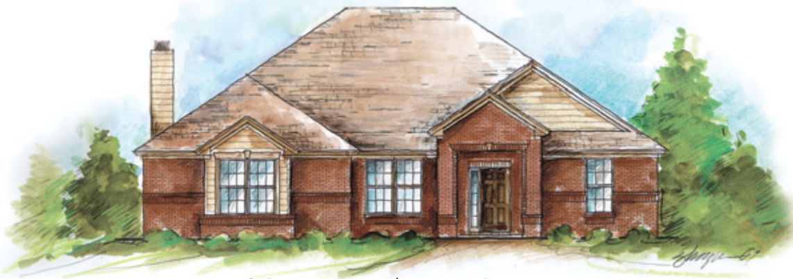
Sierra Elevation I