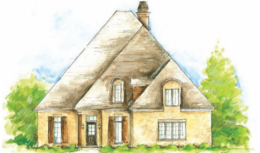
Brantley Elevation II