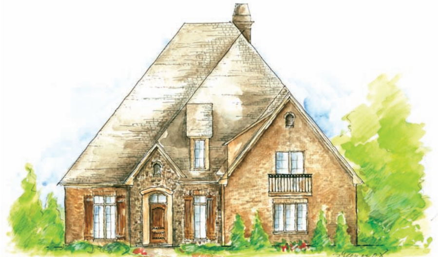
Brantley Elevation III