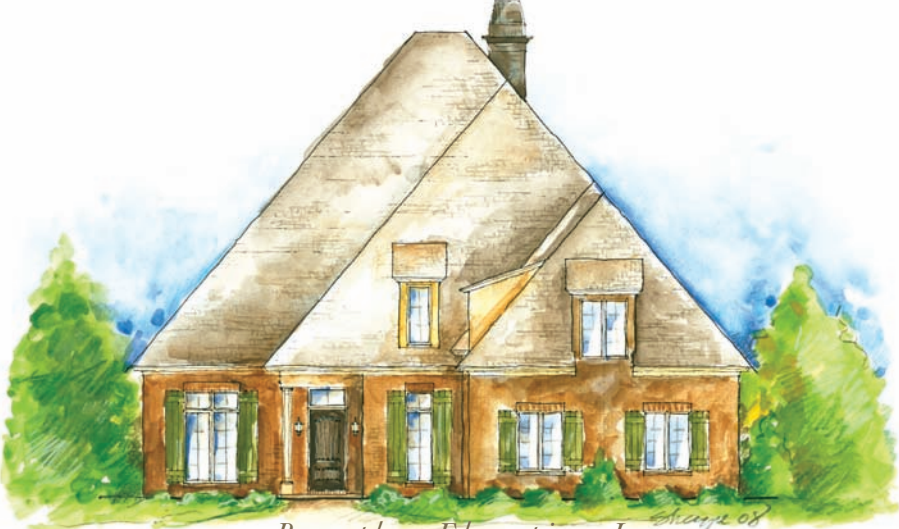
Brantley Elevation I