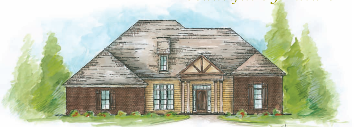
Cimarron Elevation I