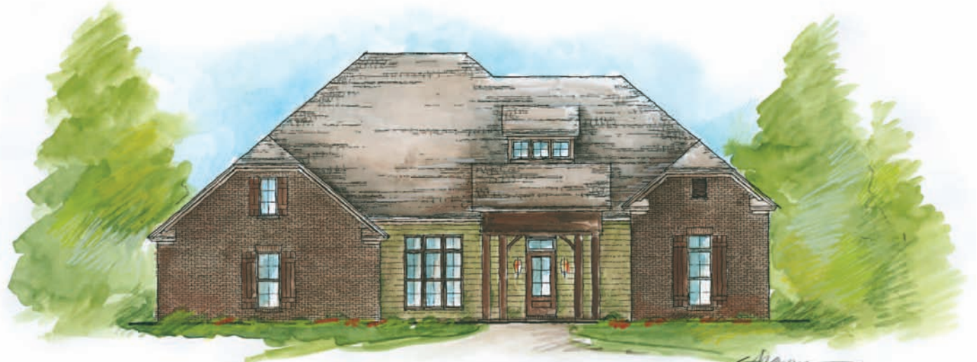
Cimarron Elevation II