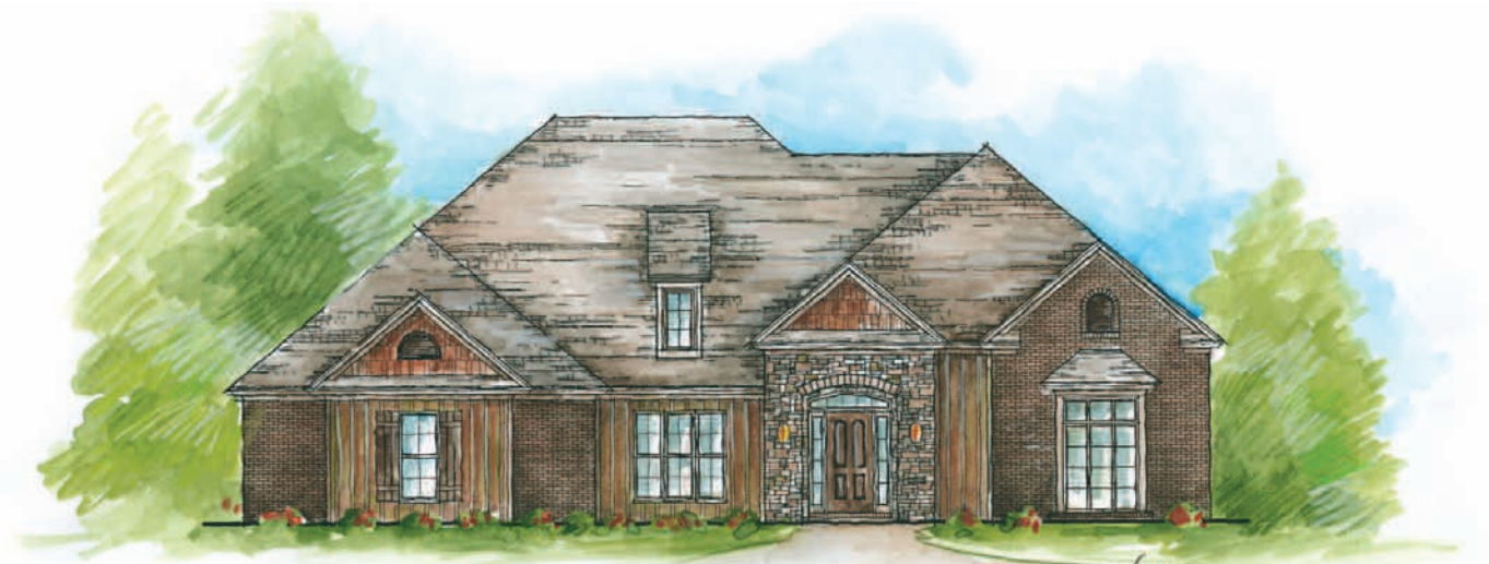
Cimarron Elevation III