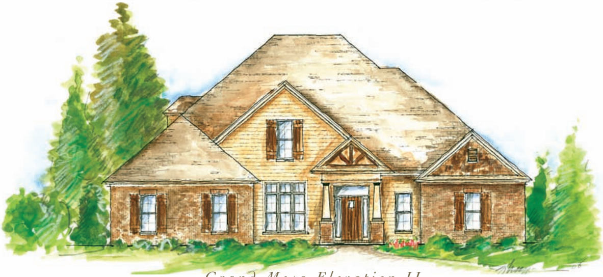
Grand Mesa Elevation II