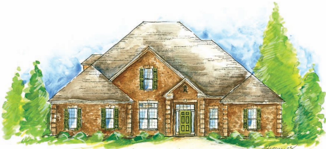
Grand Mesa Elevation I