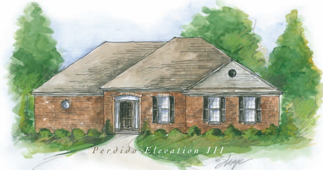
Perdido Elevation III