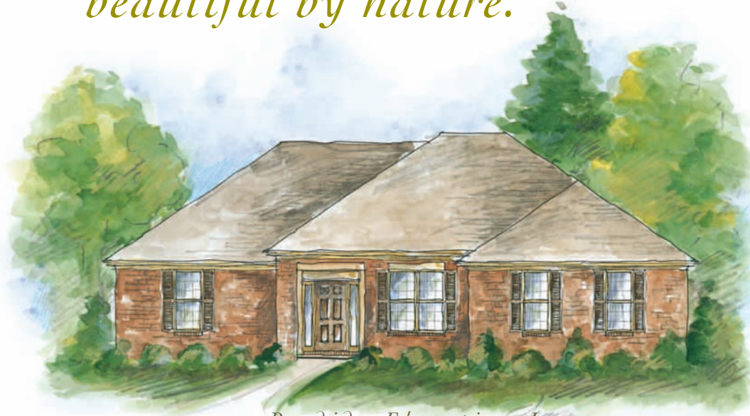
Perdido Elevation I