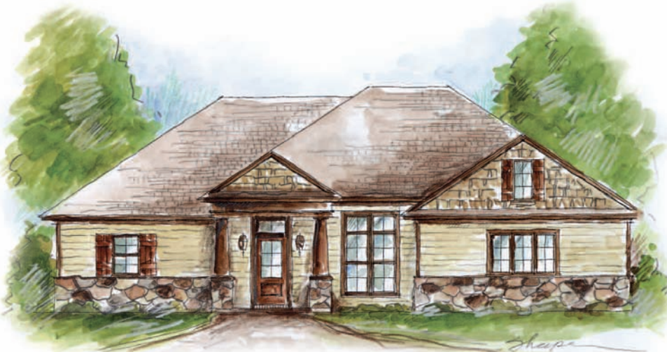
Perdido Elevation II