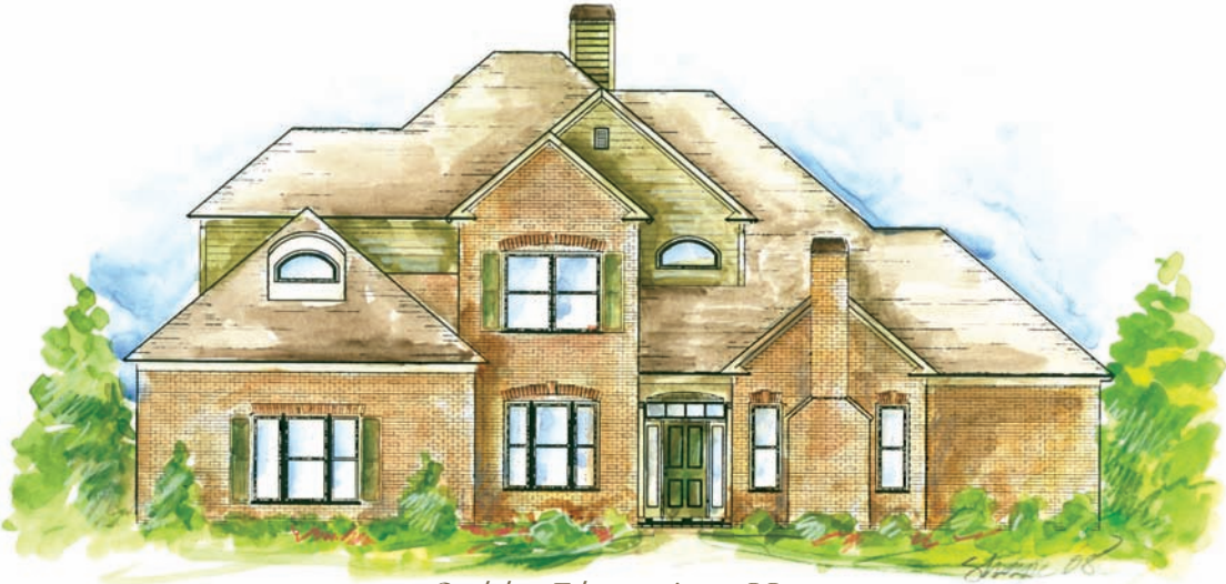
Sable Elevation II