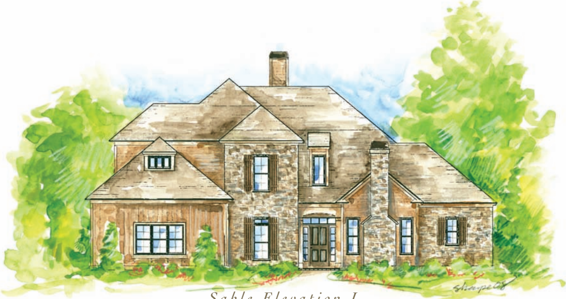
Sable Elevation I