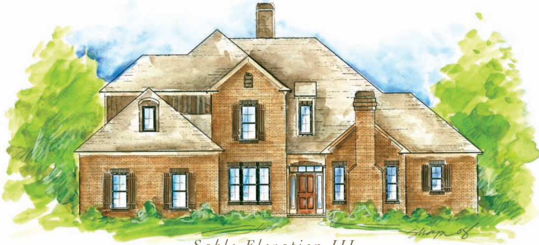
Sable Elevation III