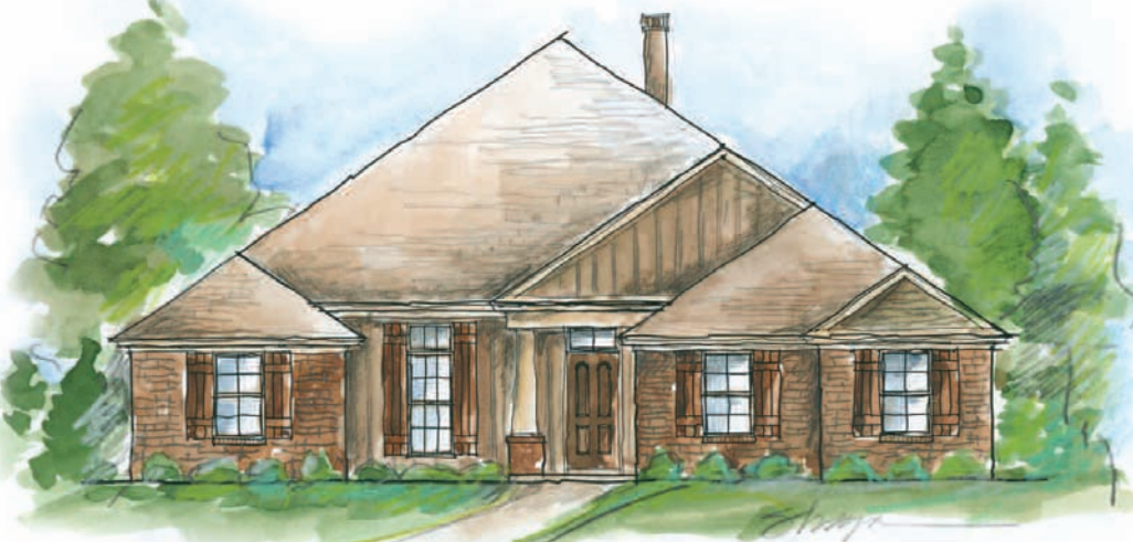
St. Joe Elevation II