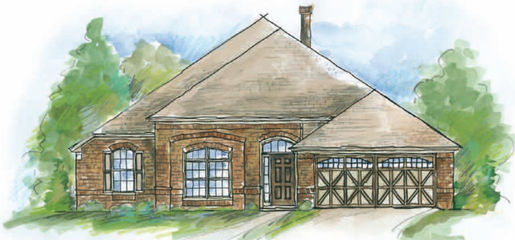
St. Joe Elevation III