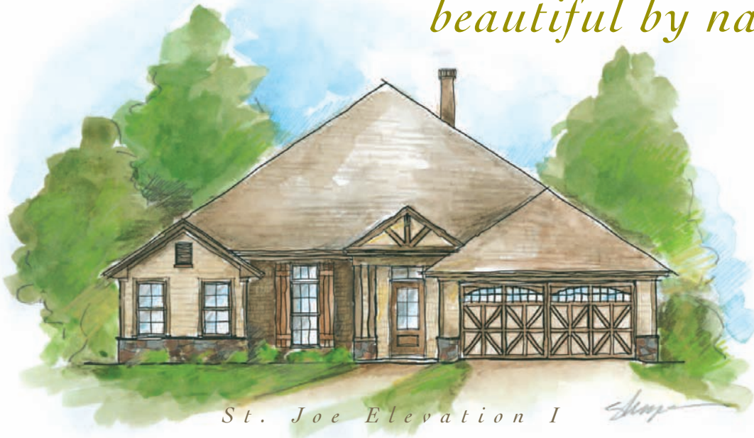
St. Joe Elevation I