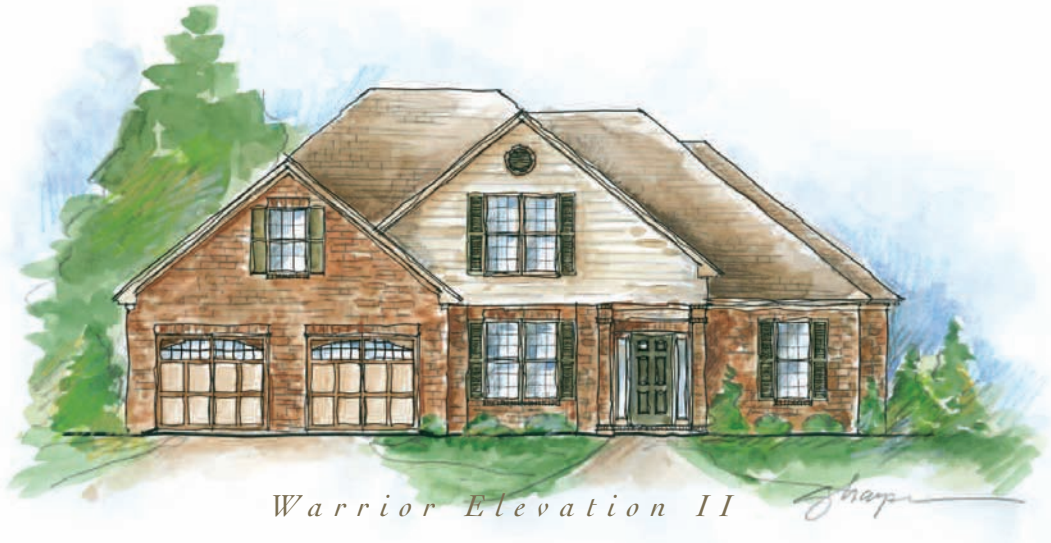
Warrior Elevation II