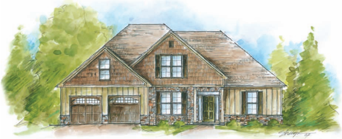
Warrior Elevation I