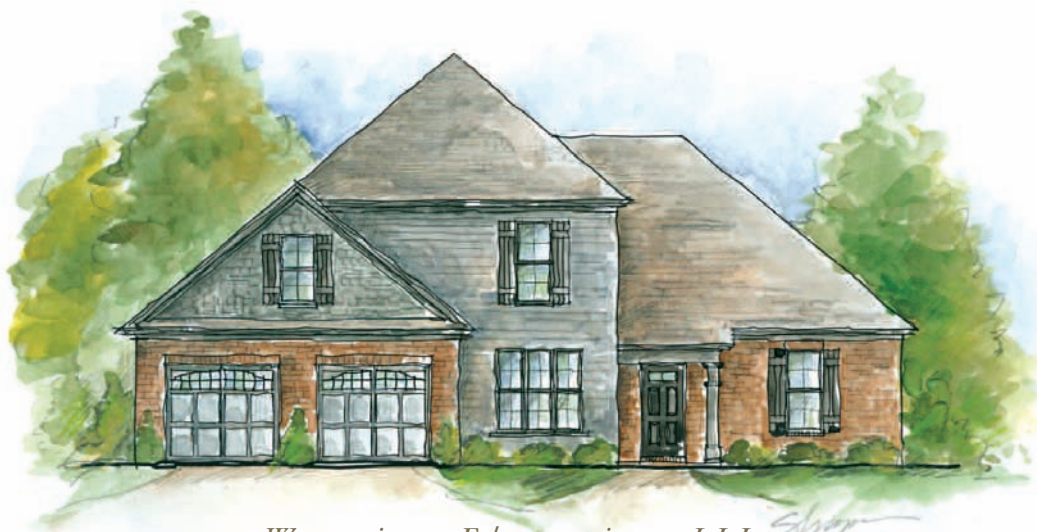
Warrior Elevation III