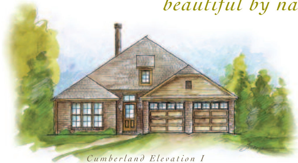
Cumberland Elevation I