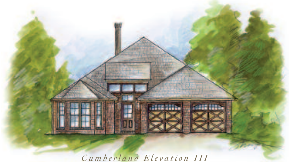
Cumberland Elevation III