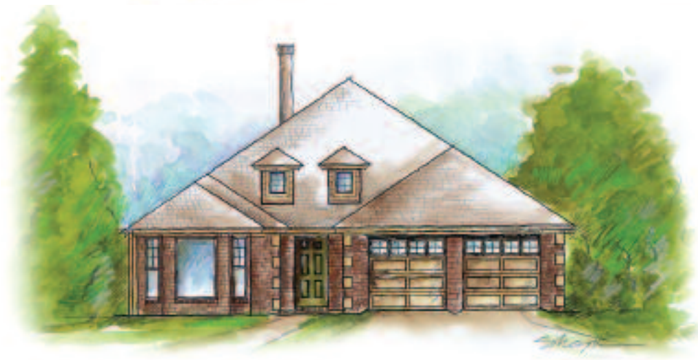
Cumberland Elevation II